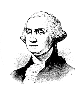
The Father of the United States of America