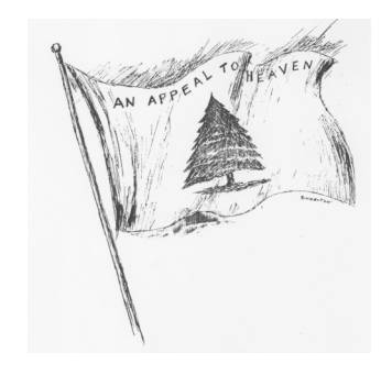
The Flag of Washington's Cruisers, a squadron of six schooners that Washington outfitted at his expense.

During all the national perplexities after the return of peace, incident to financial embarrassments and an imperfect system of government, Washington was regarded, still, as the public leader; and when a convention assembled to modify the existing government, he was chosen to preside over their deliberations. And again, when the labor of that convention resulted in the formation of our Federal Constitution, and a president of the United States was to be chosen, according to its provisions, his countrymen, with unanimous voice, called him to the highest place of honor in the gift of a free people.